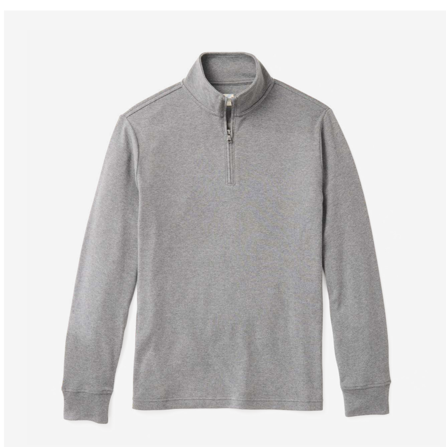
Larchmont Seawool Quarter Zip