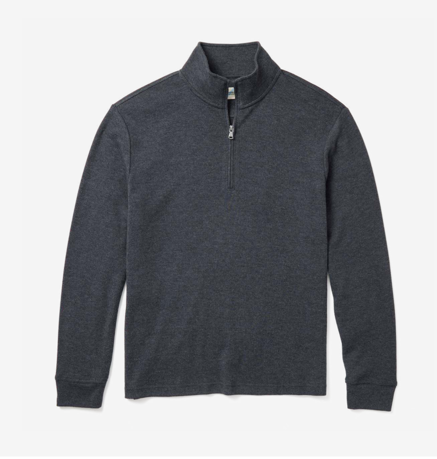
Larchmont Seawool Quarter Zip